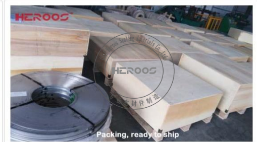
Packing, ready to ship