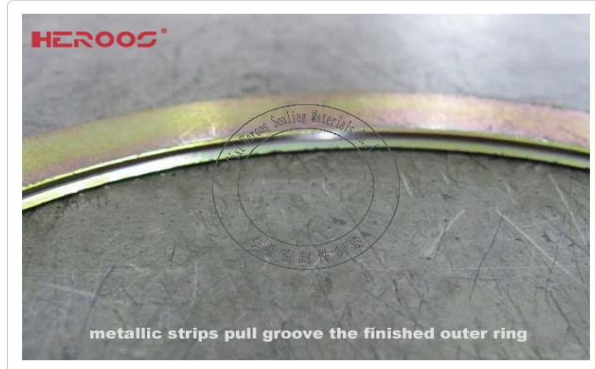
metallic strips pull groove the finished outer ring

The materials can be CS, 304(L), 316(L), 321, 317L etc.