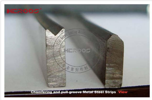
Chamfering and pull groove-Metal Steel Strips View

This metallic Strip is suitable for the use of metal spiral wound gasket inner ring and outer ring, according to customer requirements, the steel strip is chamfered, Pull grooving or flat strips. angle 90°,100°,110°- 120°.