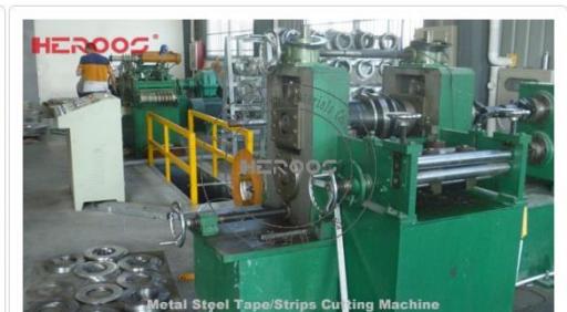
Metal Steel Tape/Strips Cutting Machine