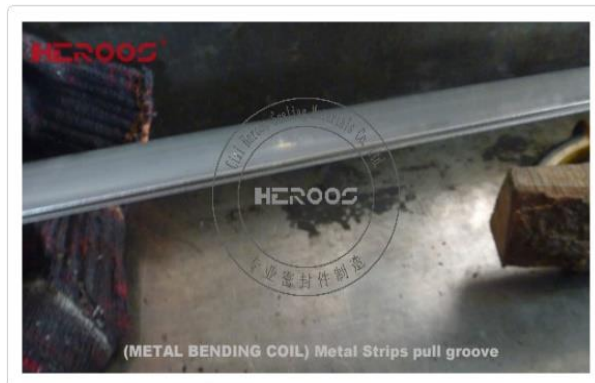
(METAL BENDING COIL) Metal Strips pull groove