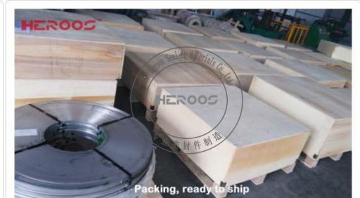
Packing, ready to ship