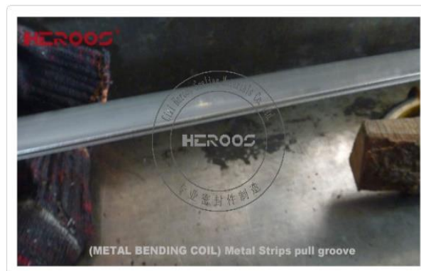
(METAL BENDING COIL) Metal Strips pull groove