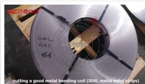
cutting a good metal bending coil (304L metal steel strips)