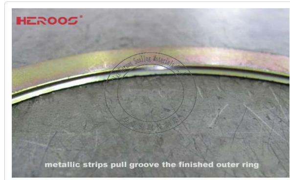
metallic strips pull groove the finished outer ring

The materials can be CS, 304(L), 316(L), 321, 317L etc.