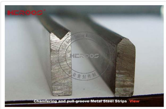
Chamfering and pull groove Metal Steel Strips View

This metallic Strip is suitable for the use of metal spiral wound gasket inner ring and outer ring, according to customer requirements, the steel strip is chamfered, Pull grooving or flat strips. angle 90°,100°,110°- 120°.