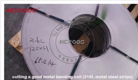
cutting a good metal bending coil (316L metal steel strips)