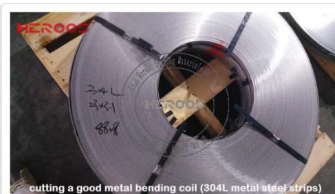
cutting a good metal bending coil (304L metal steel strips)