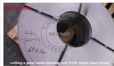
cutting a good metal bending coil (316L metal steel strips)