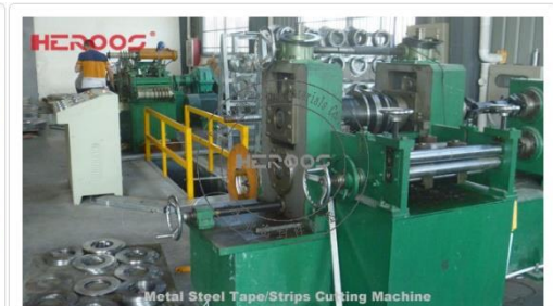
Metal Steel Tape/Strips Cutting Machine